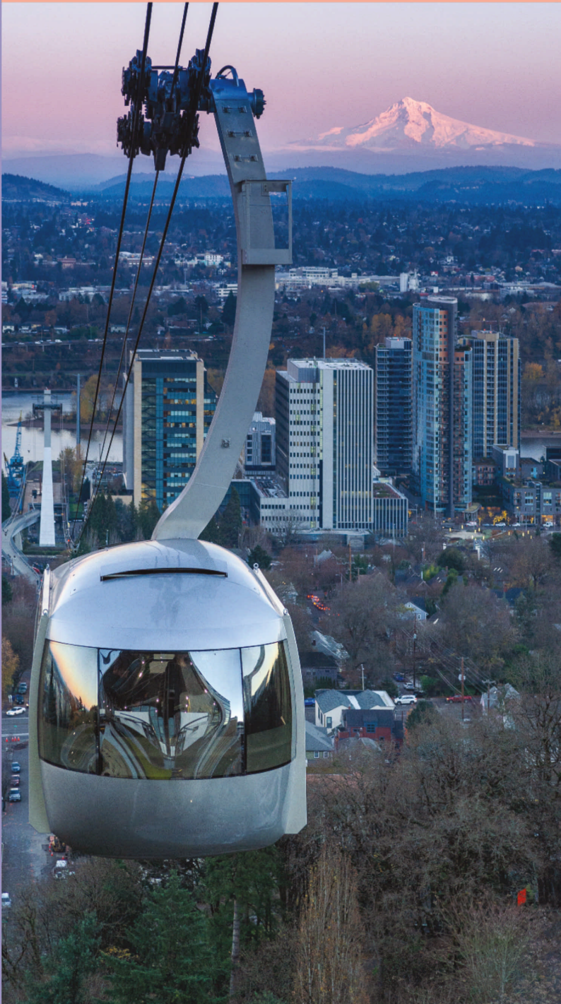
COVER PHOTO BY DIEGO DIAZ