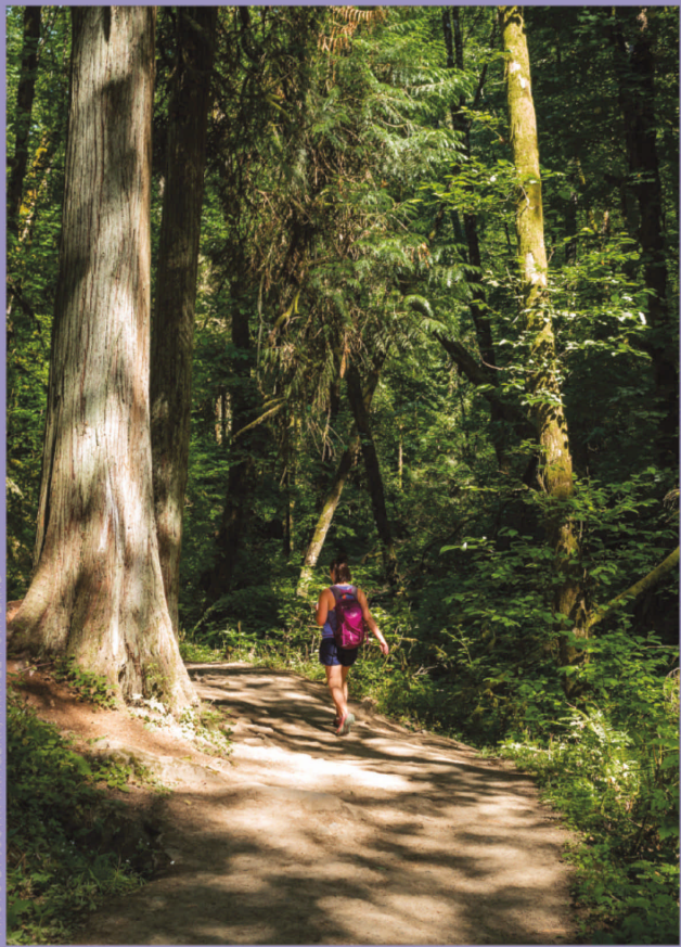
TRAVEL - PORTLAND